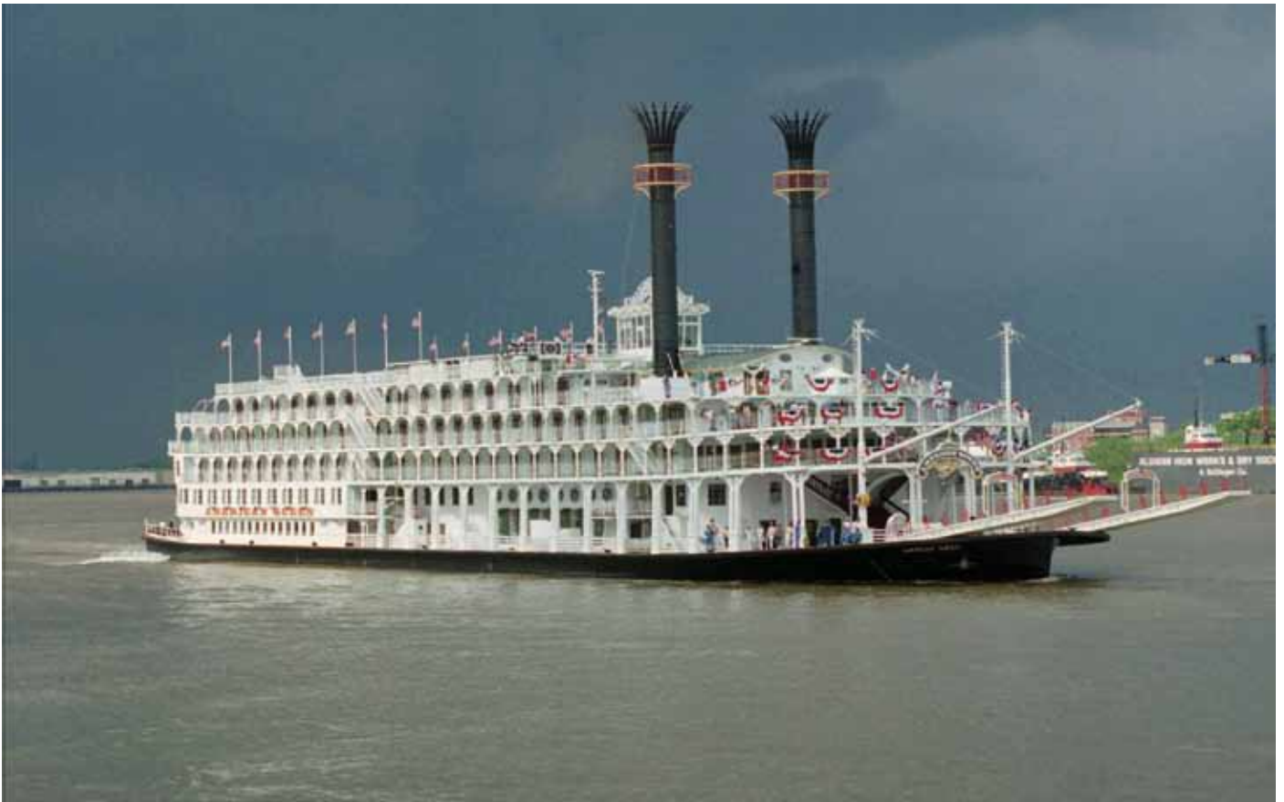
The American Queen, the largest steamboat ever built, arrives in the port of New Orleans May 4, 1995.