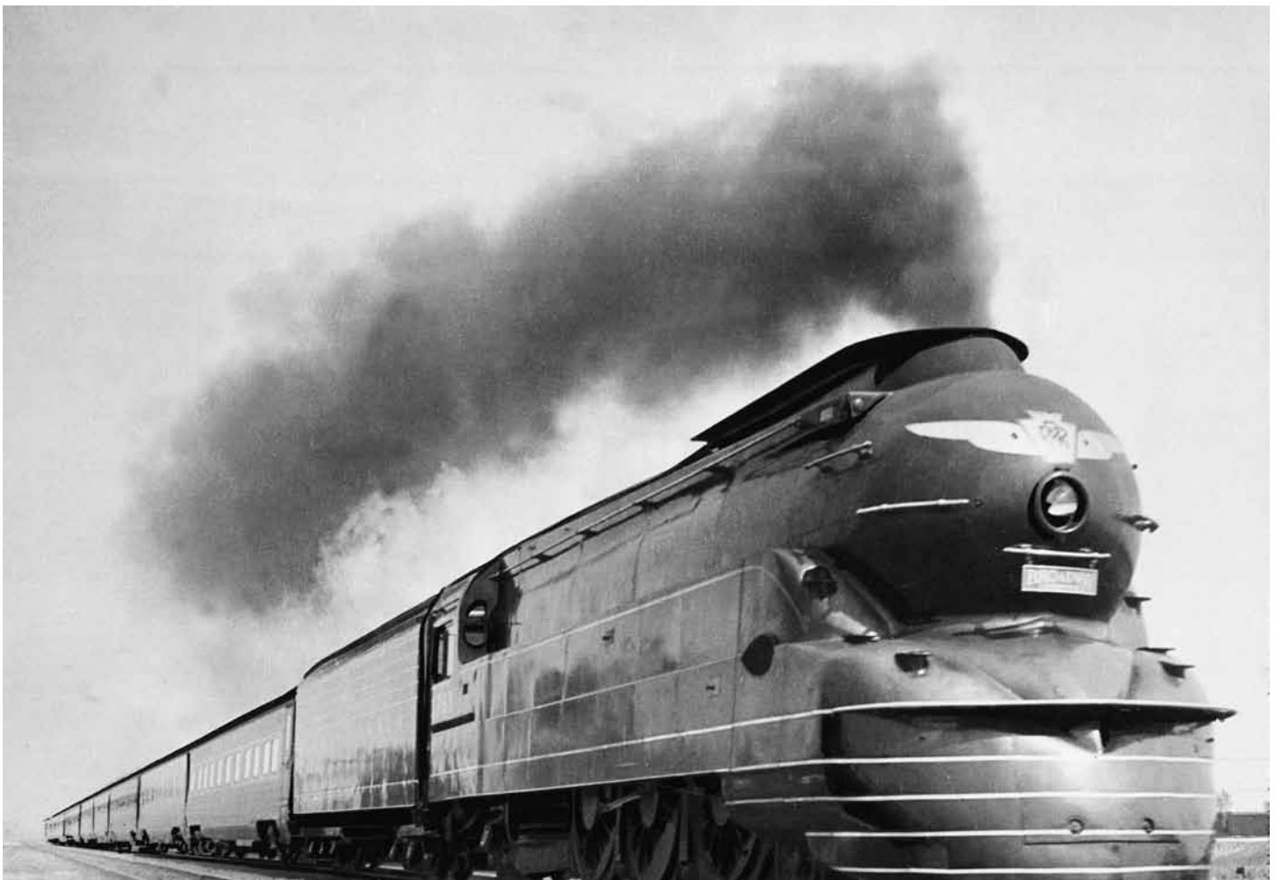
The Pennsylvania Railroad's Broadway Limited train is shown on June 7, 1938. The train was in service between Chicago and New York City June

A: Yes. I think so. I think it is very much a part of American culture, because when you think about it, the first people ever in America were immigrants coming from very, very far away. And that sort of culture and spirit has never changed in America. So, absolutely, I think that's why so