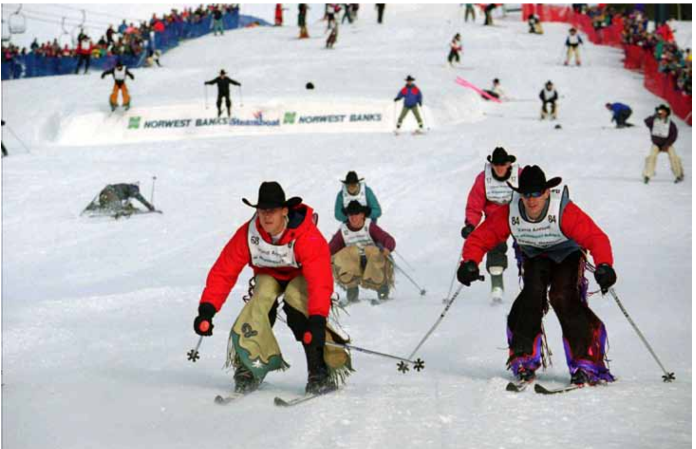
Cowboys race down the slopes in a mad dash for the finish line at the annual Cowboy Downhill in Steamboat Springs, Colorado on Tuesday, Jan. 16, 1996.

Overall, the reasons for America's great mobility are varied. However, undoubtedly, one of the reasons originates in a centuries old culture of movement that comes from people's desire for better opportunities and freer lives.