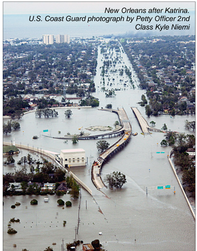
New Orleans after Katrina.

Since colonial times Louisianans have built levees along the rivers to help control the water. However, on August 29th the rain from Hurricane Katrina flooded New Orleans when the levees failed to save the city. Katrina killed over 1,200 people and displaced a million, including nearly a quarter of a million school students.