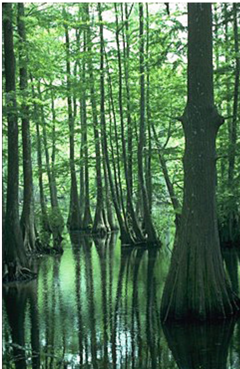
Chicot State Park Lake, Cajun Country, Louisiana

"New Orleans food is as delicious as the less criminal forms of sin." Mark Twain