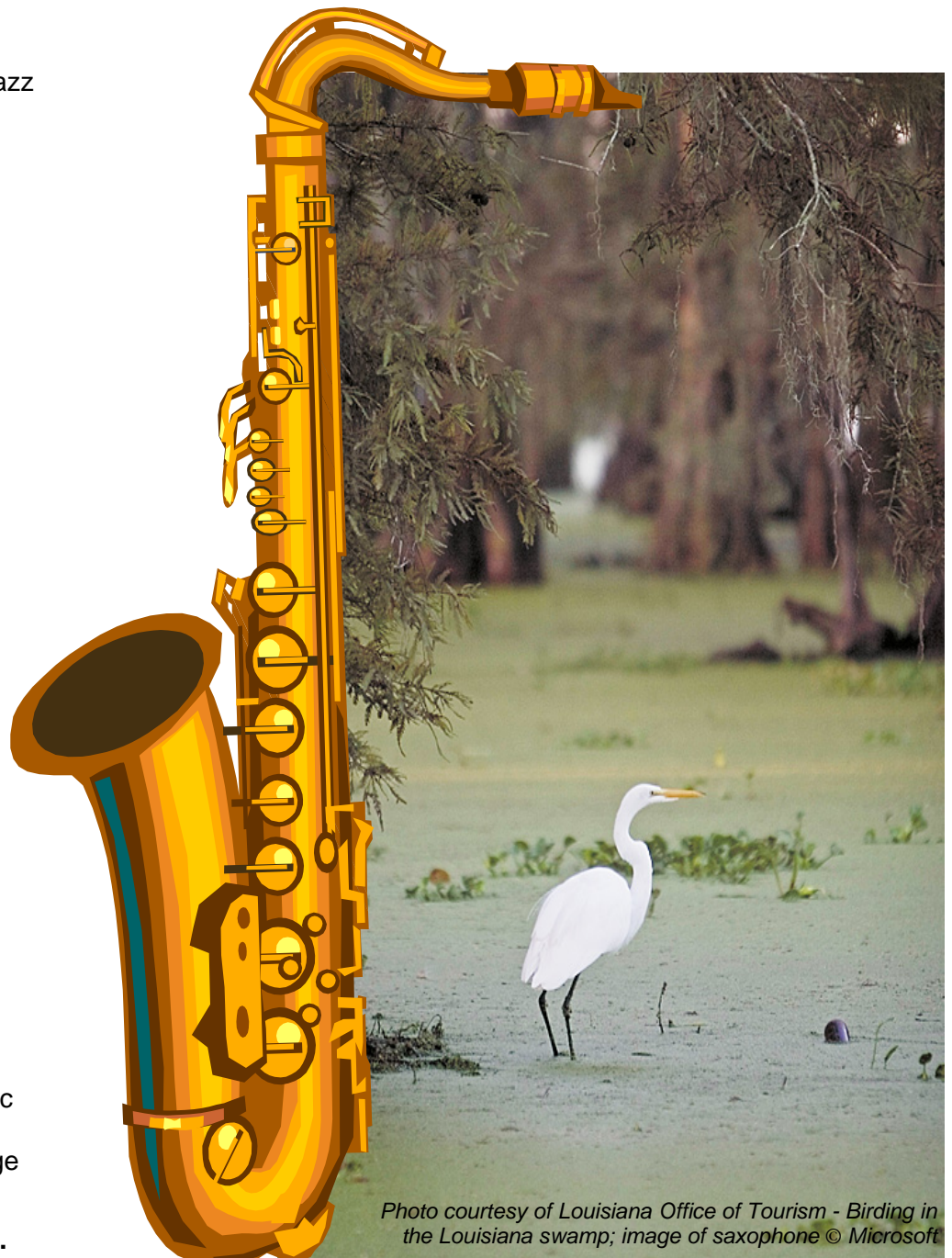
Photo courtesy of Louisiana Office of Tourism - Birding in the Louisiana swamp; image of saxophone © Microsoft