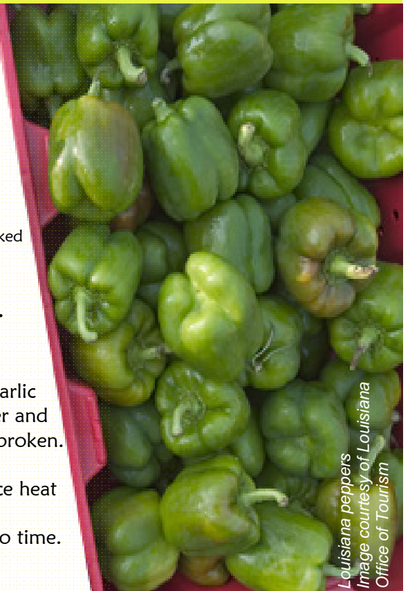
Louisiana peppers

Fry onion, green pepper and garlic in butter. Add tomatoes, water and spices. Stir until tomatoes are broken. Add the remaining ingredients. Cover and bring to boil. Reduce heat and simmer under a cover for 30 minutes stirring from time to time. Serve with a fresh baguette.