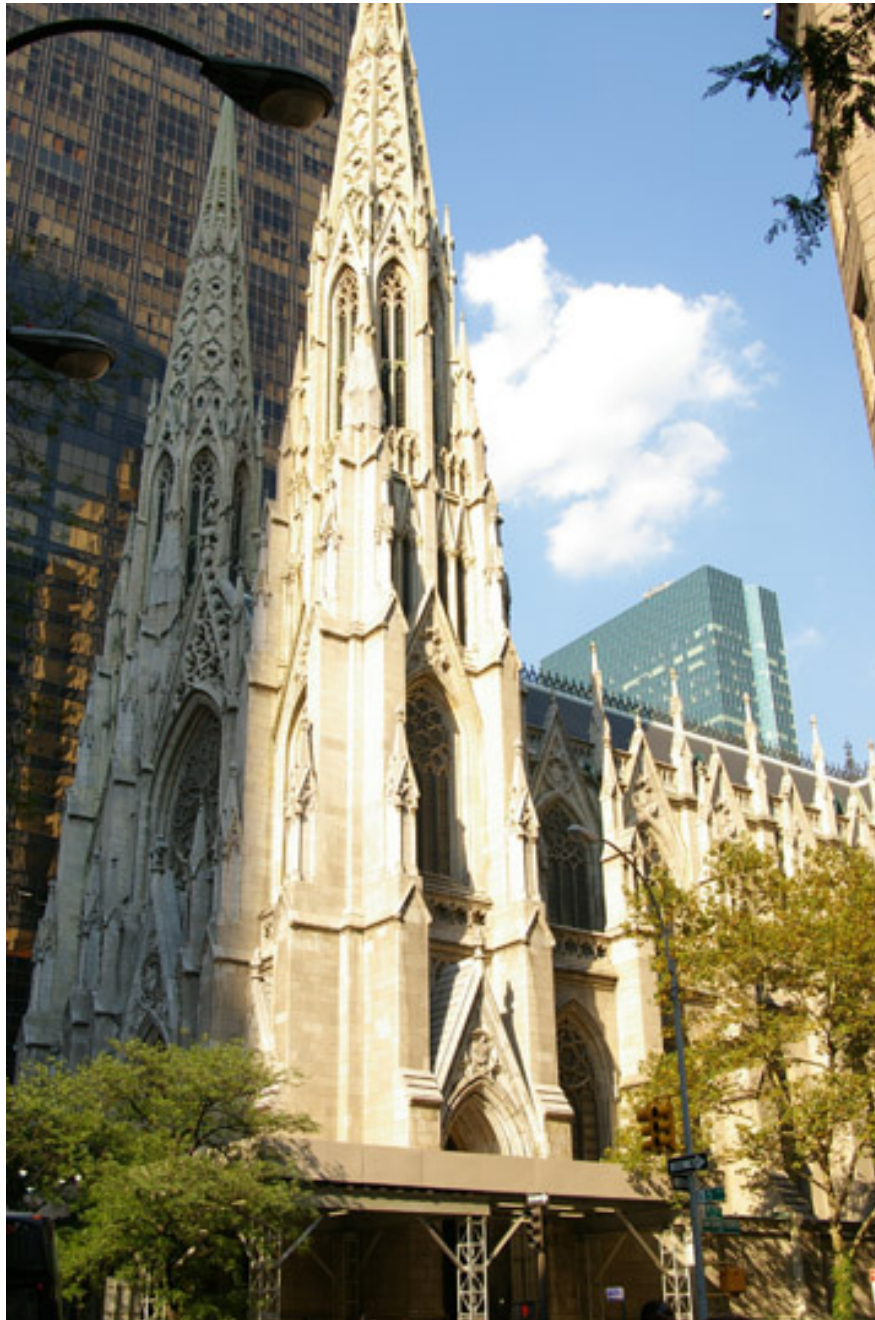
St. Patrick's Cathedral in New York

His experiences in Ireland left a lasting mark on young Patrick. He decided to go back, but this time as a missionary to convert the Irish to Christianity. Preparing for this goal he traveled to France to study religion, first in a monastery of Lerne and then to Auxerre, where his teacher was bishop Saint Germanus. When the first Irish missionary, Palladius, died in 431, Patrick was sent to follow in his footsteps.