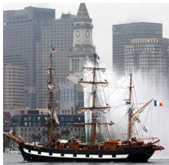
The Jeanie Johnston, a replica of a 19th-century Irish emigrant barque.