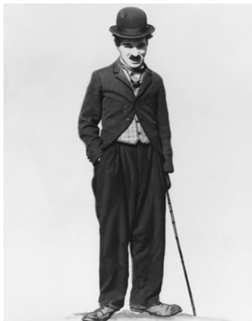
Charlie Chaplin

■ Exercise 1 Put the words from below the texts into the blanks: