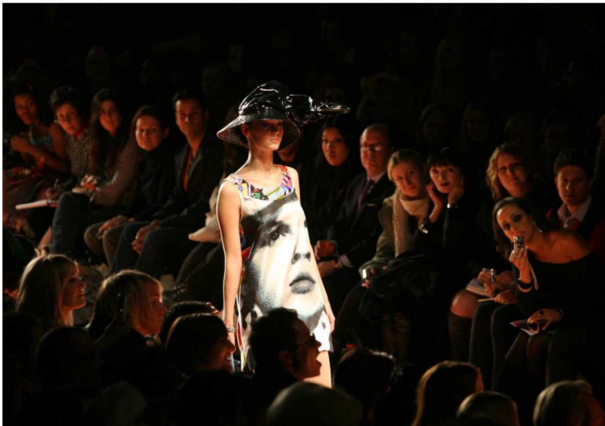
A model wearing a dress with the face of actress Judy Garland walks the runway in a "Wizard of Oz" themed presentation at the Heatherette show during Fashion Week, Tuesday, Feb. 6, 2007 in New York