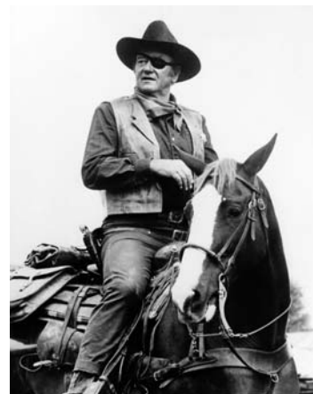
John Wayne

What an unforgettable bard of the cowboy myth he was! John Wayne in his black shirt and a leather ... (5), with an impeccably clean ... (6) round his neck and a black, felt ... (7) on his head. Charming to ladies, tough to bad guys, he created an image of a brave, manly character, a free and independent hero of open spaces whose home is vast prairies. Clothes are just as important as his tough character in painting this romantic image of a cowboy. They give him not only the look of importance, but ensure him comfort under the scorching sun, the thundering sky or in the streams of torrential rain.