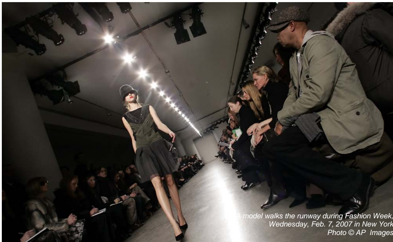
A model walks the runway during Fashion Week, Wednesday, Feb. 7, 2007 in New York

Young people who want to pursue a career in the fashion industry might consider studying at the Fashion Institute of Technology, or FIT for short, in New York. Here, they can learn about clothing, accessories, textiles, exhibition design, and cosmetics, as well as develop skills essential for the global clothing industry such as marketing, fashion and textile conservation, and how to organize exhibitions and shows. The students have the opportunity to use the school's various facilities which include photography studios, painting rooms, a sculpture studio, a print-making room, a graphics laboratory, display and exhibit design rooms, life-sketching rooms and a model-making workshop. FIT has a museum with one of the world's largest and most important collections of clothing, textiles, and accessories with about 50,000 exhibits.