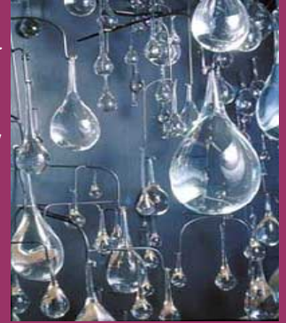
Graham Caldwell Elizabeth's Tears (detail), 2002 Glass, steel, water and wood 96 x 612 x 42 in. (243.8 x 1554.5 x 106.7 cm) overall

"I am interested in the intersection of the organic and the mechanical, as is exemplified by the joints of skeletons, the bifurcations of plants, or the veinwork of the electrical grid. Joints between parts are important events within individual works, and the concept of connection and interdependence is a central theme. The connections often involve lines which open into volumes or congeal into droplets. (...) I am looking for the bones of the invisible."