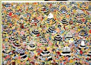
Choir (detail), 2003 Installation: For a Floor of Flora Mixed media on canvas 97-5/8 x 137-1/2 in. (248 x 349.3 cm) overall Courtesy of the artist and Whitney Museum of American Art, New York, New York Purchase, with funds from the Contemporary Committee 2003.194