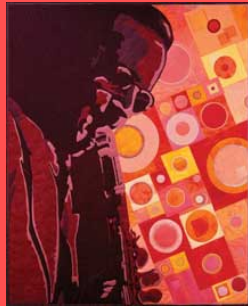
Just Swing, ? 2001 Threadwork on dyed and layered silk, cotton, lam and ultrasuede 50 x 41 in. (127 x 104.1 cm) Courtesy of the artist, Santa Fe, New Mexico

the music makes me feel. I am intrigued by the complete sound that comes from several instruments collaborating."