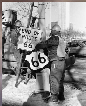
Workers remove signs that mark the end of U.S. Route 66 in Chicago, Ill., Jan. 17, 1977.

Despite this demise, fortunately Route 66 meant too much for too many to