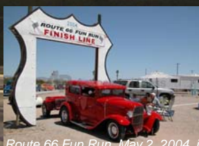
Route 66 Fun Run, May 2, 2004, in Golden Shores, Ariz.