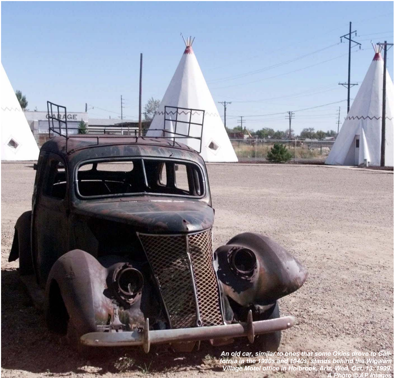
An old car, similar to ones that some Okies drove to California in the 1930s and 1940s, stands behind the Wigwam Village Motel office in Holbrook, Ariz. Wed. Oct. 13, 1999.