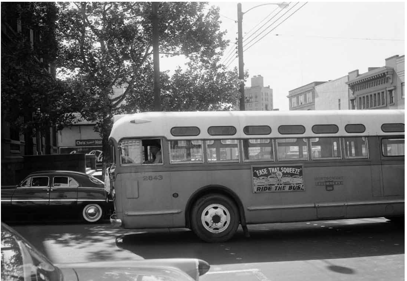
In this April 26, 1956 photo, a bus driver is all alone as his empty bus moves through downtown Montgomery, Alabama, as a boycott continues even though the bus company has ordered an end to segregation. The 60th anniversary of the Montgomery bus boycott is widely credited with helping spark the modern civil rights movement.

We know it's been a long journey. For some it goes back to before the beginning of our republic. For others, back since the Civil War; for others, throughout the 20th century. But for most of us alive today, in a very real sense this journey began 43 years ago, when a woman named Rosa Parks sat down on a bus in Alabama and wouldn't get up. She's sitting down with the first lady tonight, and she may get up or not as she chooses."