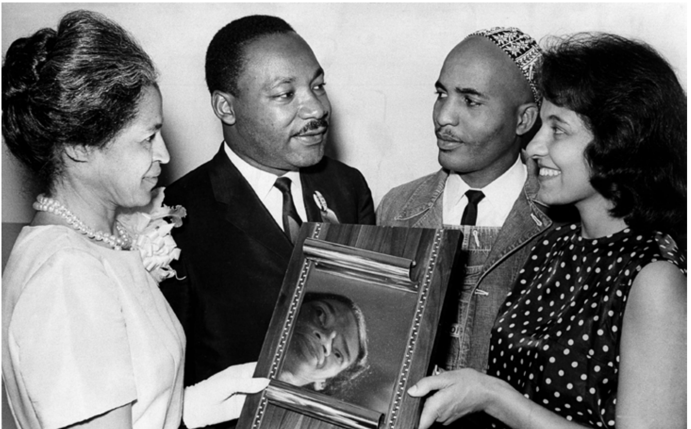
Civil Rights worker Rosa Parks, left and Dr. Martin Luther King, second from left, present the Rosa Parks Outstanding Freedom Award to Reverend James Bevel and his wife Diane Bevel in a ceremony at the annual Southern Christian Leadership Conference in Birmingham, Alabama, August 13, 1965.