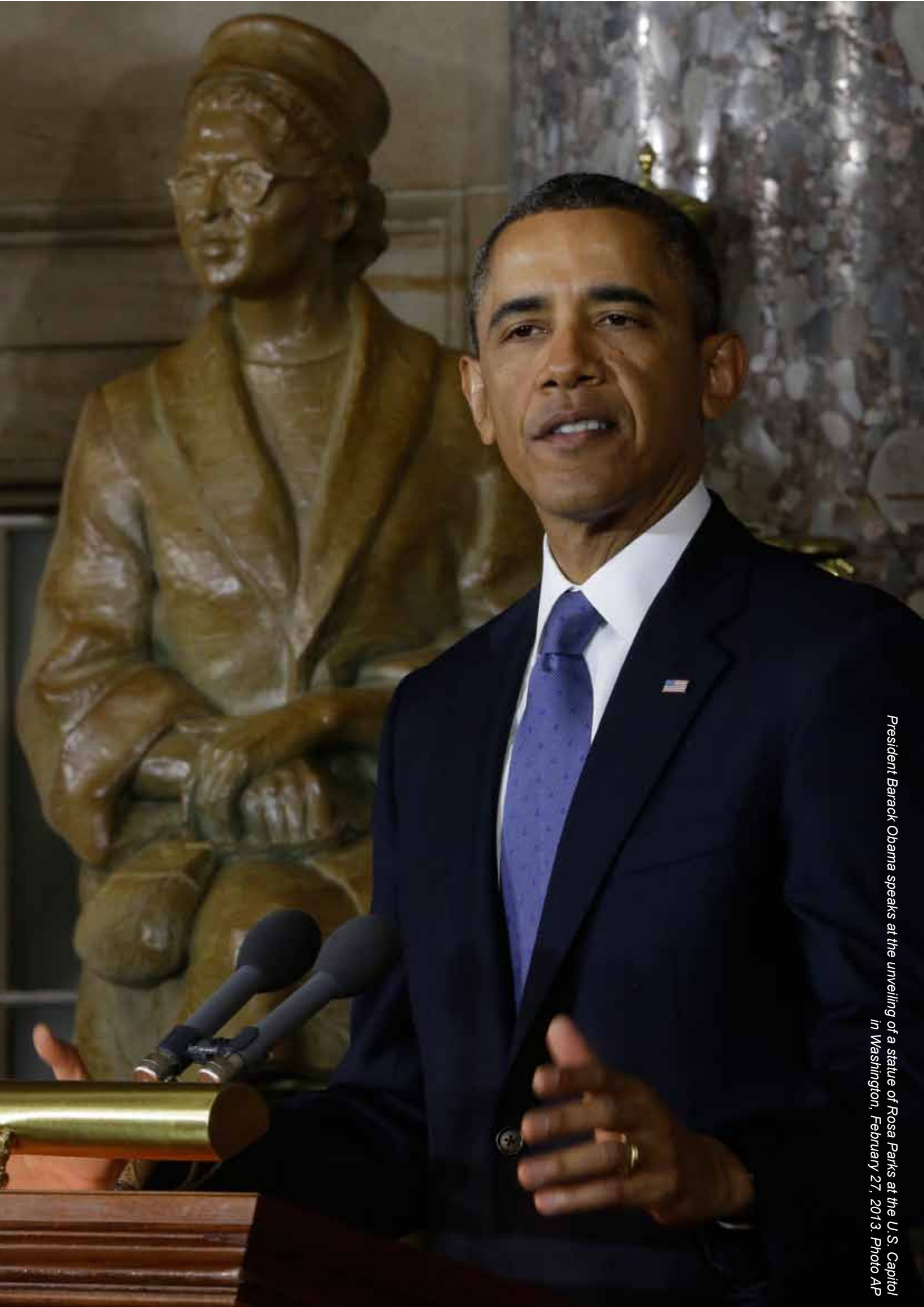
President Barack Obama speaks at the unveiling of a statue of Rosa Parks at the U.S. Capitol in Washington, February 27, 2013.