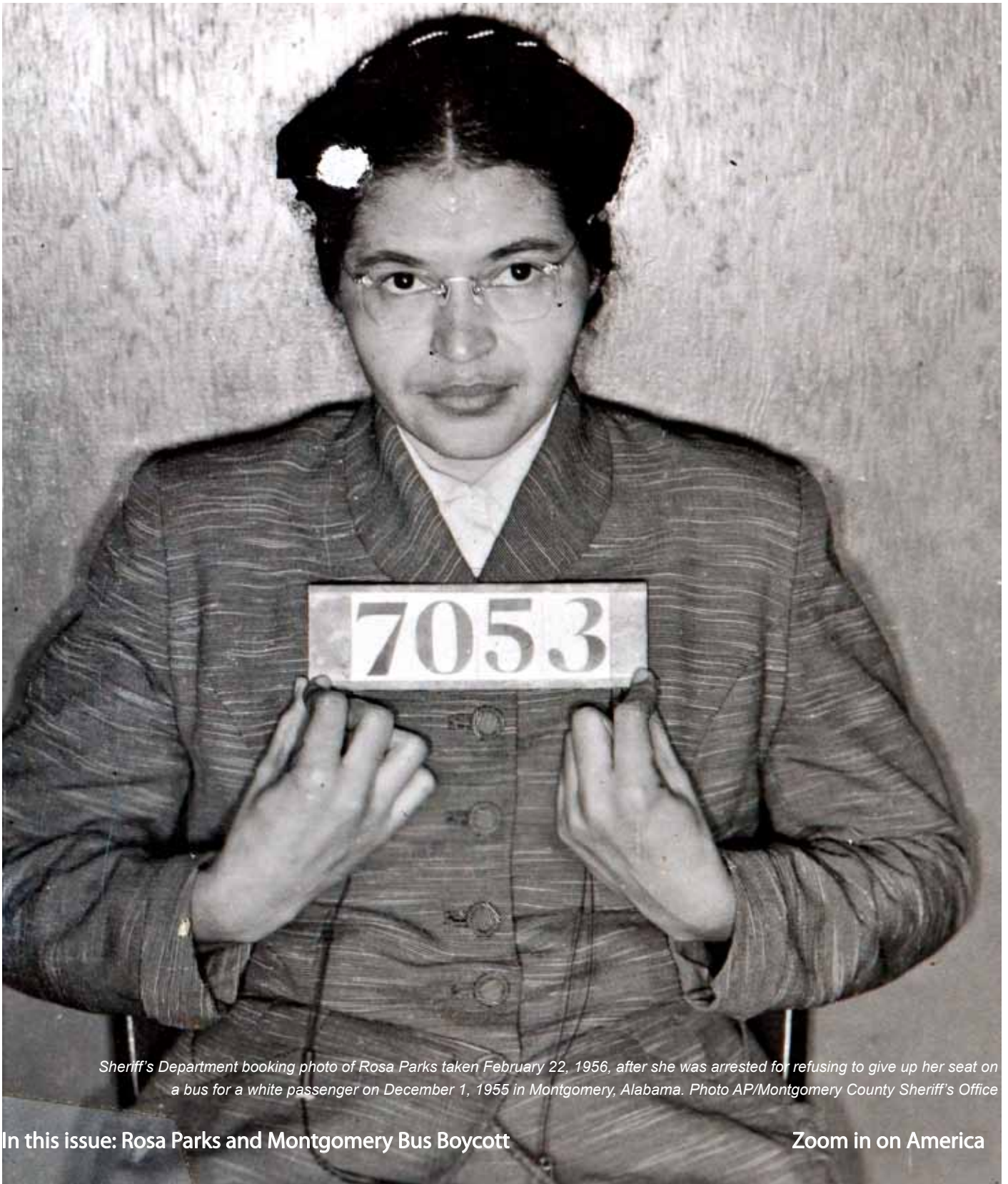
Sheriff's Department booking photo of Rosa Parks taken February 22, 1956, after she was arrested for refusing to give up her seat on a bus for a white passenger on December 1, 1955 in Montgomery, Alabama.

In this issue: Rosa Parks and Montgomery Bus Boycott