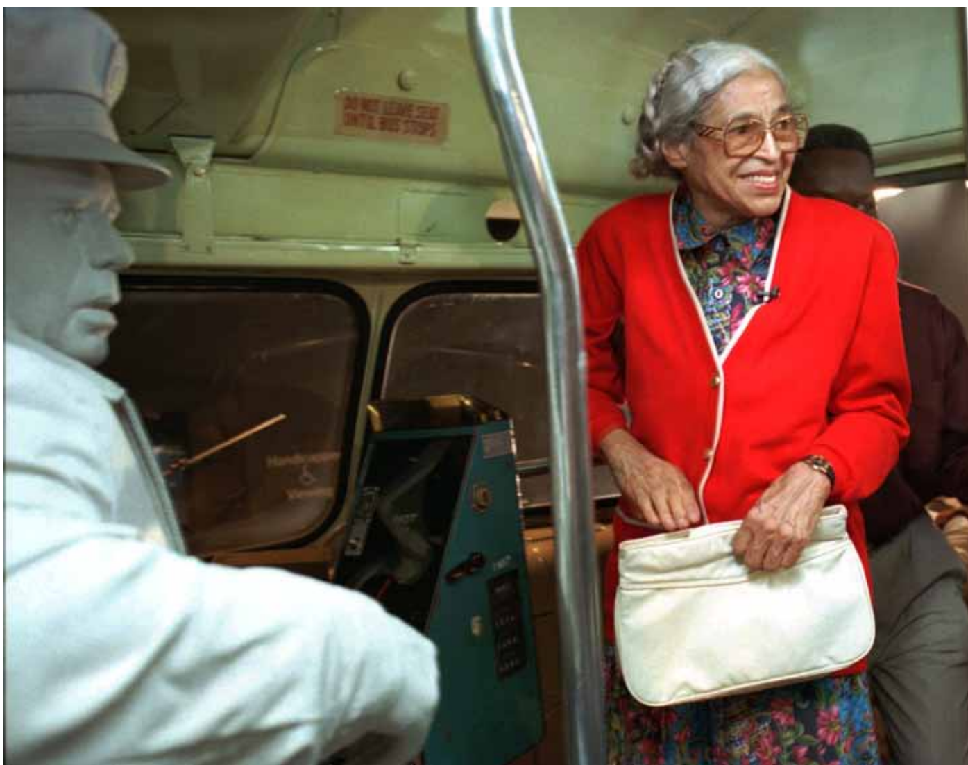
Rosa Parks visits an exhibit illustrating her bus ride of December 1955 at the National Civil Rights Museum in Memphis, Tennessee, Saturday, July 15, 1995. Parks visited the city to inaugurate her three-week "Freedom Ride" throughout the country.

The boycott resulted in longed for legal changes: on June 5, 1956, a Montgomery federal court ruled that any law requiring racially segregated seating on buses violated the 14th Amendment to the U.S. Constitution. That amendment, which was adopted in 1868 after the American Civil War, guarantees all citizens, regardless of race, equal rights and equal protection under state and federal laws. Even though the city appealed to the U.S. Supreme Court, the lower court's decision was upheld on December 20, 1956. Montgomery's buses were integrated on December 21, 1956, and the boycott ended. It had lasted 381 days.