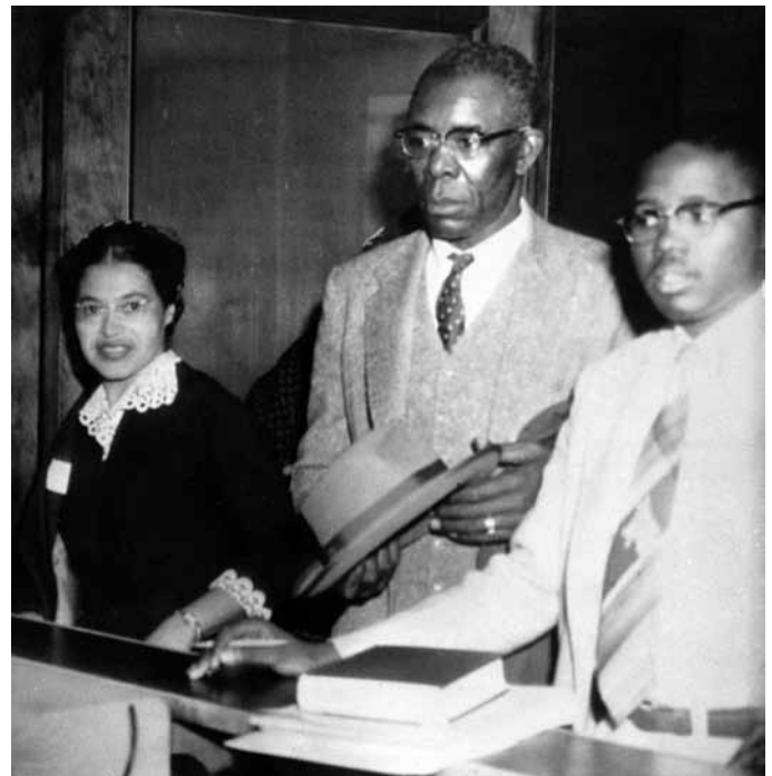
(left); A closeup of a display at the Museum of African American History on April 3, 1997, in Detroit highlights Rosa Parks; (above): Rosa Parks, left, who was fined $10 and court costs for violating Montgomery's segregation ordinance for city buses, makes bond for appeal to Circuit Court, December 5, 1955. Signing the bond were E.D. Nixon, center, former state president of the NAACP, and attorney Fred Gray. Gray hinted that the ordinance requiring segregation would be attacked as unconstitutional.