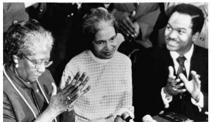
(left): Rosa Parks speaks at Ebenezer Baptist Church in Atlanta, Georgia, January 15, 1969.; (above): Rosa Parks, center, is honored, December 5, 1975 at ceremonies commemorating the civil rights crusade in Montgomery.