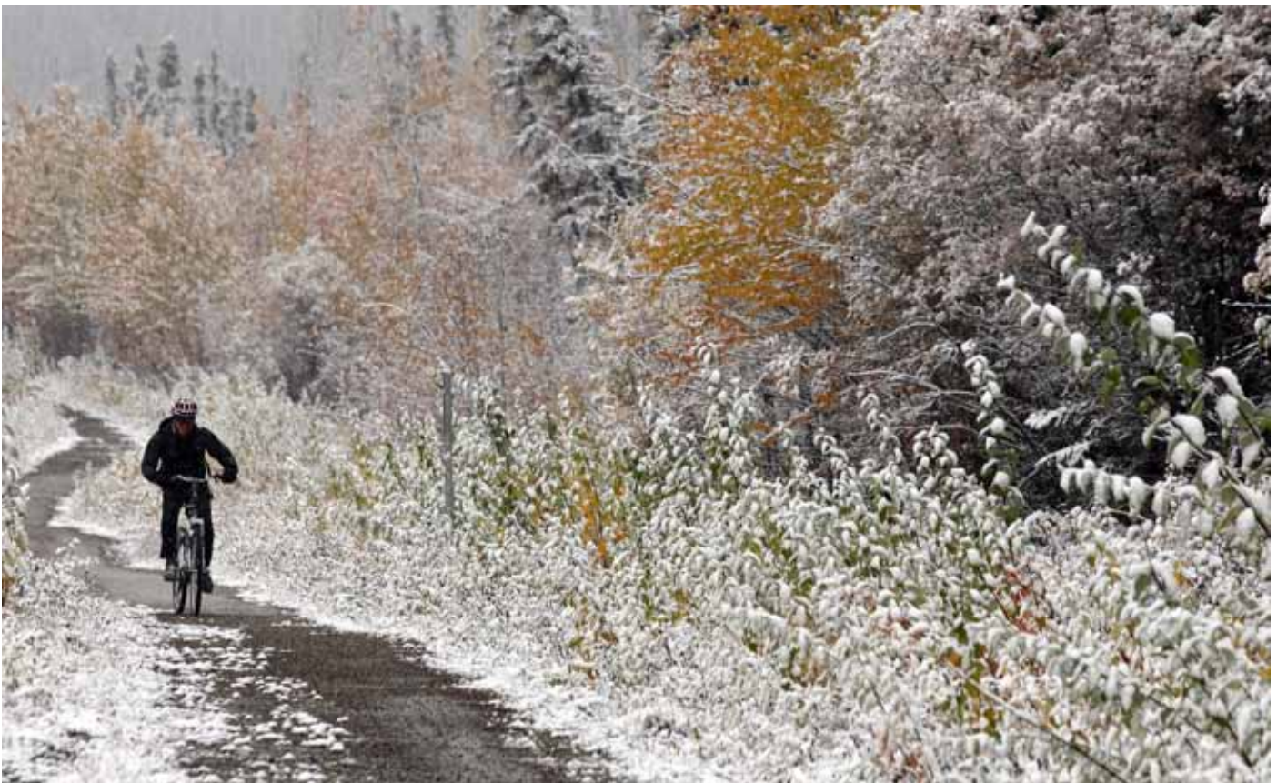
A bicyclist rides along the Sheep Creek Road bike trail as the first snow of the season continues to fall around Fairbanks, Alaska, on Wednesday morning, September 18, 2013.

On March 27, 1964, North America’s strongest recorded earthquake, with a magnitude of 9.2, rocked central Alaska. Each year Alaska has approximately 5,000 earthquakes, including 1,000 that measure above 3.5 on the Richter scale. Of the ten strongest earthquakes ever recorded in the world, three have occurred in Alaska.