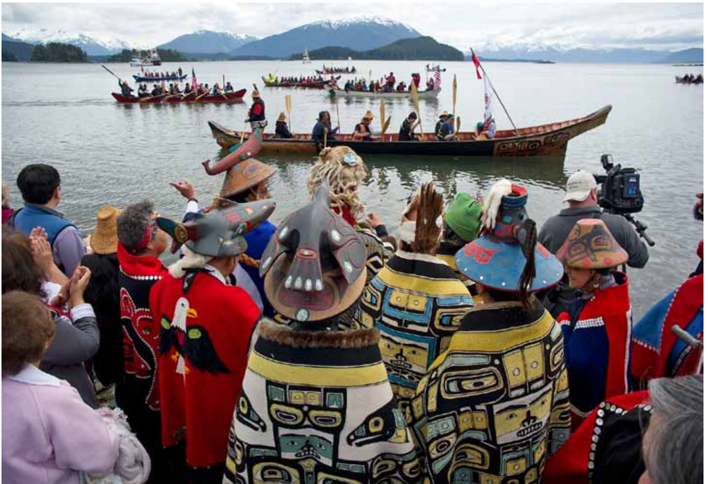
Members of the Auke Bay clan and hundreds of others greet seven canoes arriving at the Auke Recreation Area beach in Juneau, Alaska, in a Coming Ashore ceremony on Wednesday, June 6, 2012. (Photo AP)

(From the Office of Historian: https://history.state.gov/milestones/1866-1898/alaska-purchase - U.S. Department of State)