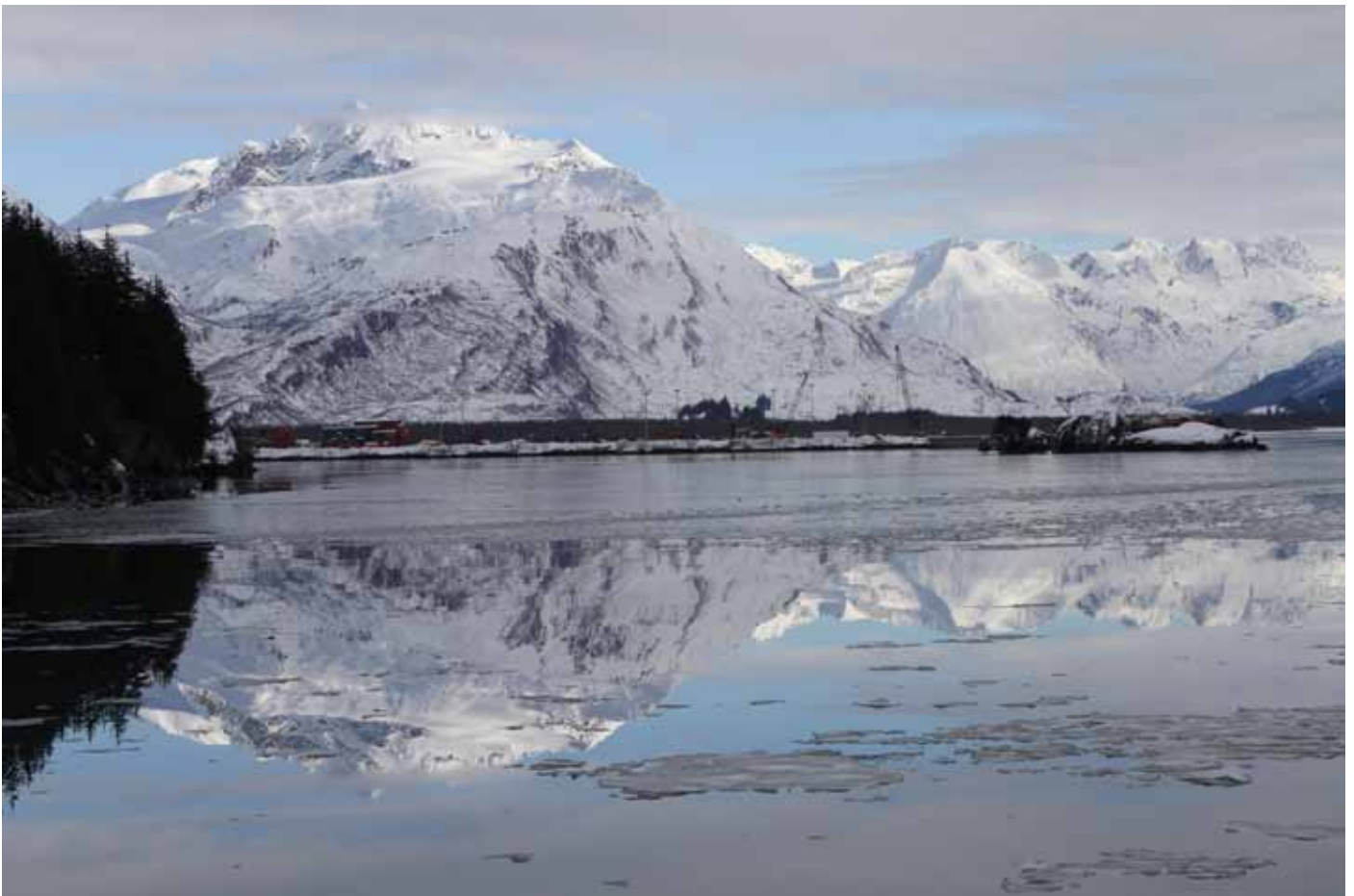
Mountains are reflected off Port Valdez in Valdez, Alaska, on Thursday, February 27, 2014.

Having made their crossing aboard anything that could float all the way from Seattle or San Francisco, the gold-seekers landed in Alaska. One hundred thousand of these stampedeers, three quarters of whom were Americans, then made their way on to the gold fields in hope of finding riches. Little did they know about the challenges that 500 miles of Alaskan territory separating them from the gold fields of Dawson had in store for them. Many never com-