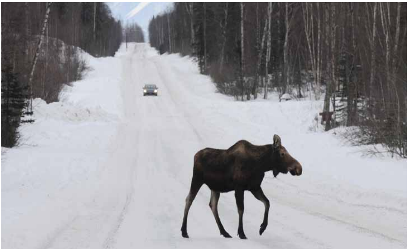
In this March 23, 2012 photo, a moose crosses a road near Anchorage, Alaska.

While moose are a big tourist attraction, tourists need to be aware that for their own safety as well as for the safety of the moose, they must not approach the animals too closely or feed the animals. A moose that becomes too familiar with humans and relies on them too much for food may be proclaimed dangerous and killed.