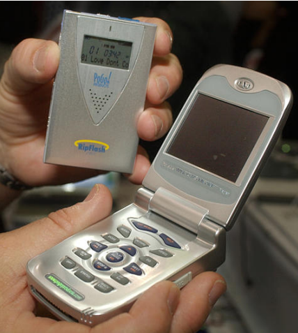
The RipFlash Pro, left, a flash memory based combination MP3 player/recorder and voice recording device, and the Flipster, a multimedia player from PoGo! Products, are shown. The Flipster allows users to watch full motion videos on a full color display, store and listen to MP3 audio, view high resolution still mages, record voice memos and play games.

According to some surveys, every third American hopes to get an item in the category of consumer electronics with the MP3 player being the hottest seller. Following the MP3 player, the wish list for the respondents included, in order of preference: plasma television, digital camera, laptop PC, big screen TV, desktop PC, video game system, high-definition television, DVD recorder and home theater speakers or system.