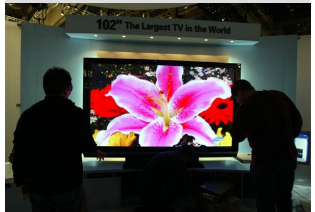
Workers at the Samsung booth of the Consumer Electronics Show at the Las Vegas Convention Center adjust the world's largest plasma television, a 102-inch screen prototype, Jan. 5, 2005. The trade show, which attracts 120,000 attendees, began with a keynote address by Microsoft's Bill Gates.