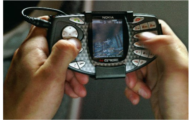
A player tries ActiVisions Tony Hawks Pro Skater video game release on the "N-Gage," Nokia's hybrid phone. The Tri-band EGSM 900/GSM1800/GSM 1900 phone included features: Bluetooth, digital music player and recorder, stereo FM radio, MP3, AAC, Midi, WAV ringing tones, and WAP over GPRS.

What's in the future for the electronic gadgets? According to an article in Wired magazine, the gadgets of the future will be simpler, that is they will no longer combine dozens of functions as most people look for just a few in one product. This applies not only to portable devices but also to computer software. Moreover, mobile phones are likely to influence our social lives to an even greater extent. We can expect mapping programs that show us whether any of our friends are nearby, reference software to look up the restaurant where we might have a meal, and better functioning voice-recognition applications.